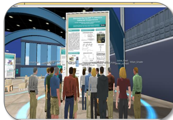
Trade Show Halls